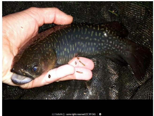
Giant Kokopu ( Galaxias argenteus ) (Vulnerable)