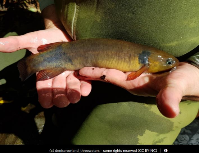
Shortjaw Kokopu ( Galaxias postvectis ) (Endangered)