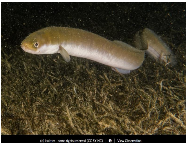
Short-finned Eel ( Anguilla australis ) (Near threatened)