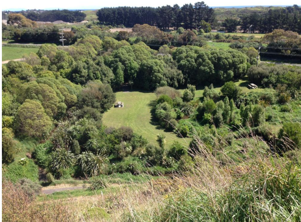
View over the picnic area near the entrance

Breaking news - exciting moment here - have just seen a male bellbird in our bottlebrush!! Yay!