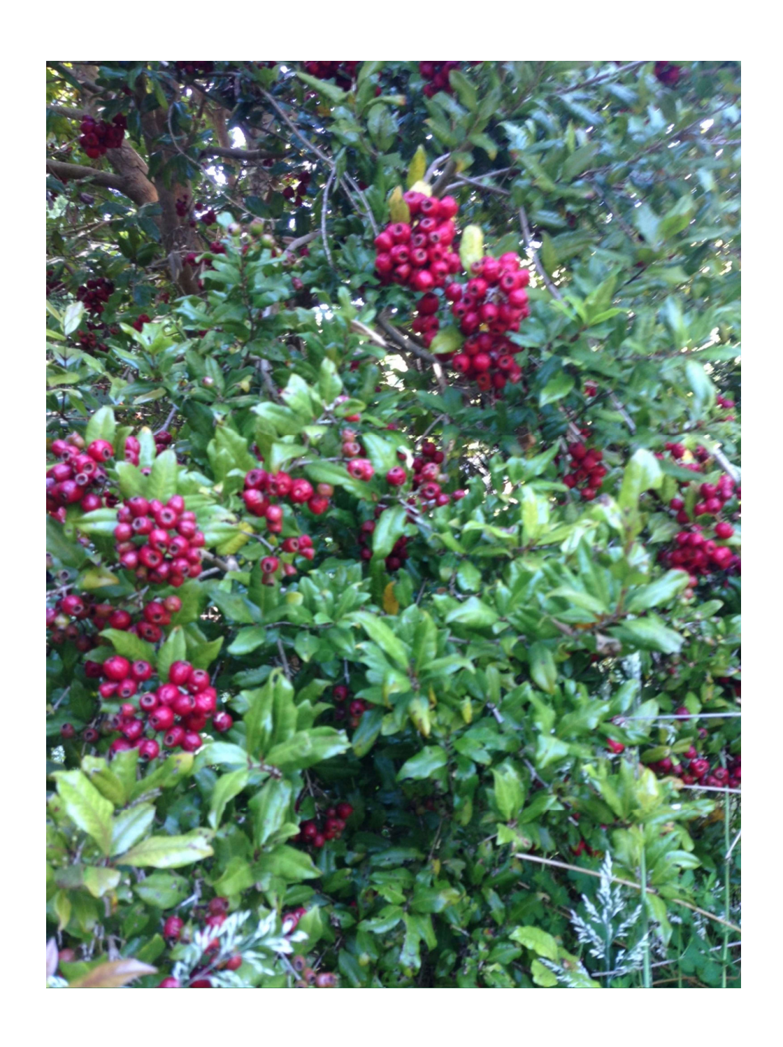
Amazing sight of swamp maire berries (just east of the Dell below Bernard's track up to the East Ridge)