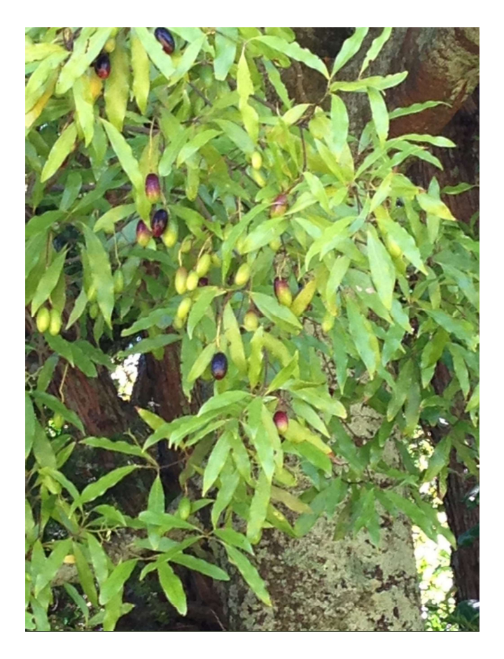
Tawa berries just sitting there and attracting Kereru