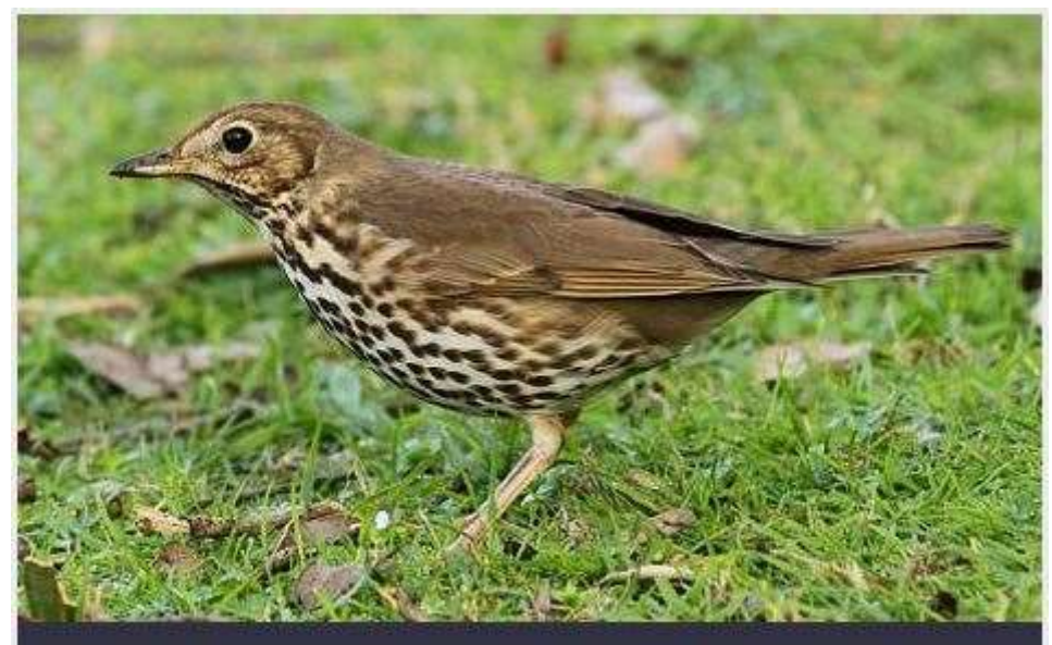
Song thrush. Adult. Wanganui, September 2010.