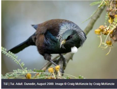
Tui | Tui. Adult. Dunedin, August 2009.

Here, the flowering was over, I expect the storm had shortened the show, but there were tuis giving their alarm calls and several bellbirds, their distinctive solitary note, heard.