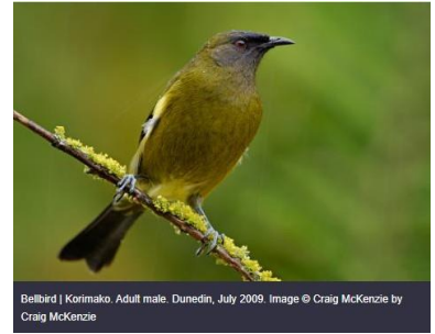
Bellbird | Korimako. Adult male. Dunedin, July 2009.

Here, the flowering was over, I expect the storm had shortened the show, but there were tuis giving their alarm calls and several bellbirds, their distinctive solitary note, heard.