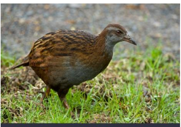
Weka. Adult North Island weka. Russell, July 2014.

Background info from the wonderful nzbirdsonline.org.nz here <u>Weka | New Zealand Birds</u> <u>Online (nzbirdsonline.org.nz)</u>