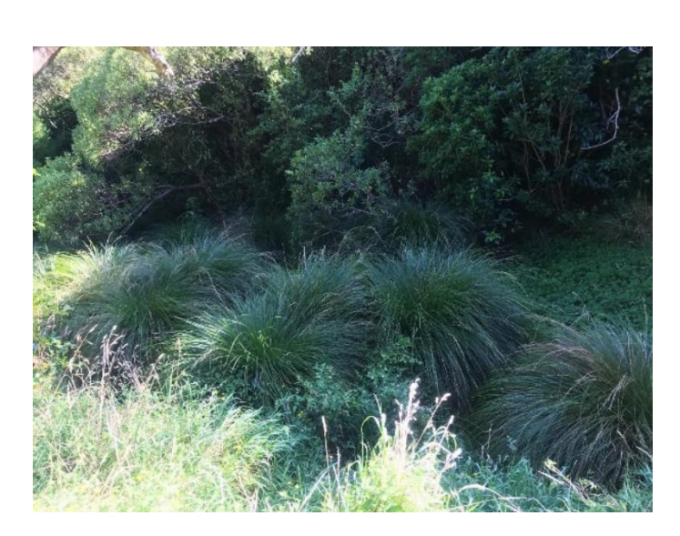
Carex in the Dell