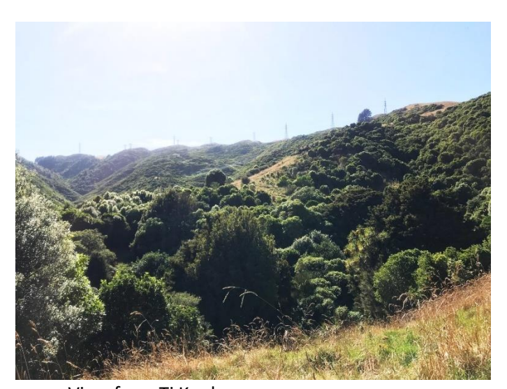
View from Ti Kouka