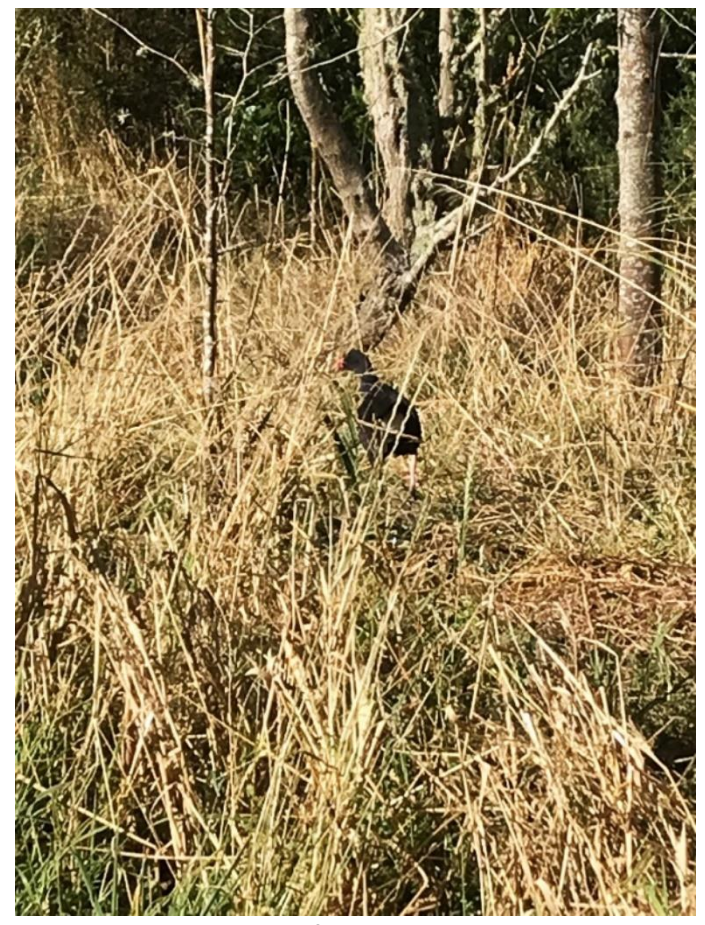
A pukeko looking for a weka