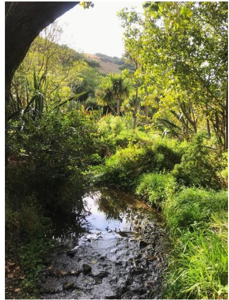
And a stereotypical bucolic image from Whareroa Farm on 22.3.24...