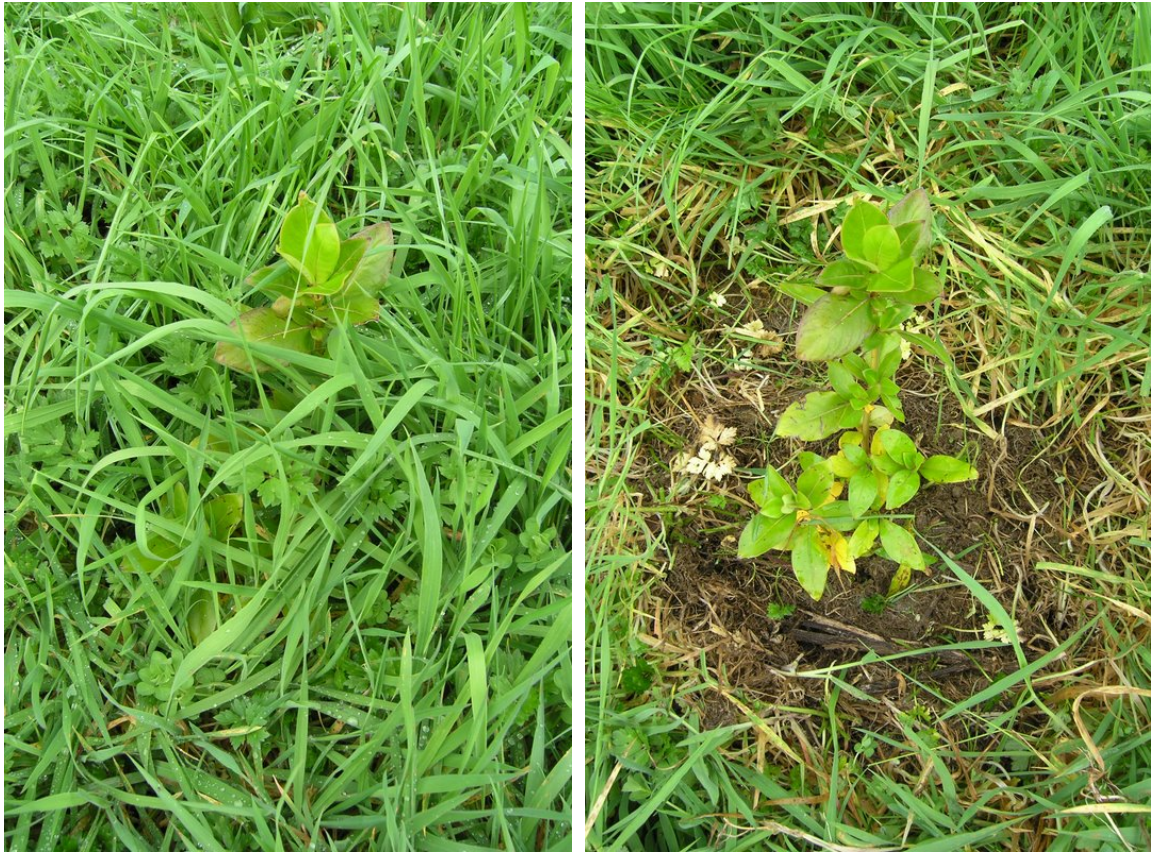
"Releasing". Plant before and after, now needs carpet square

Hope to see a good turn out for this extra planting session.