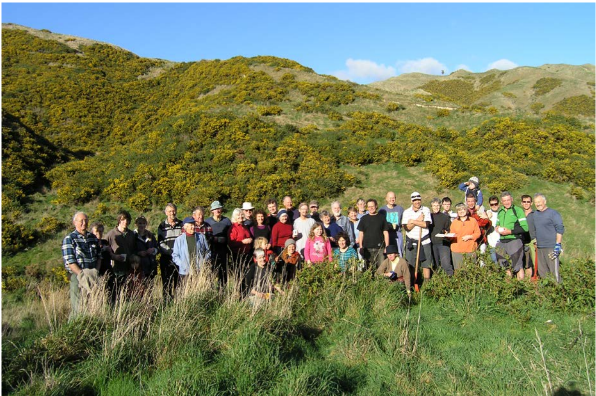
Planting in Carex Valley July 2009