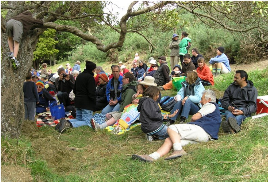
Picnic March 2009 – in the Dell

Whareroa Stream planting site, 2 years after planting: