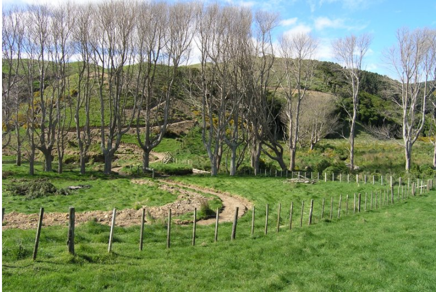
New track under construction

Plans for the entrance development are being finalised and tenders will then be let. Present timeline is for opening in the new year.