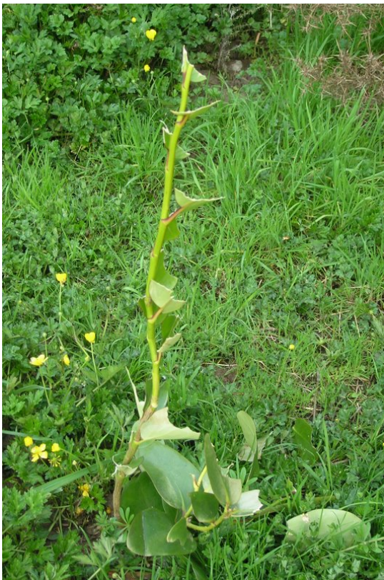
Goat damage to new plants

We were sad to see some goat browsing, see photo. DOC were set to act but the goats have cleverly vanished from the farm or at least out of sight. If anyone sees goats, please let us know their number and location.