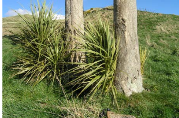
New growth at base of Ti Kouka now stock removed

DOC are assessing the tenders to build the entrance track and intend this to be done in September. DOC are also advertising the grazing lease this week.