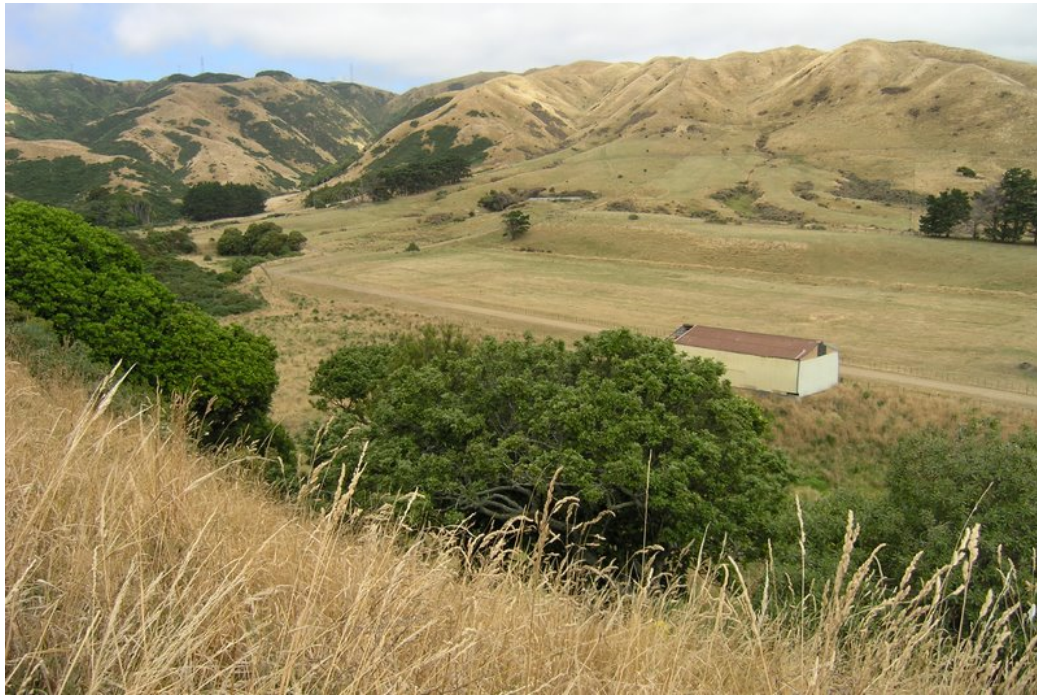
Looking south east from proposed track