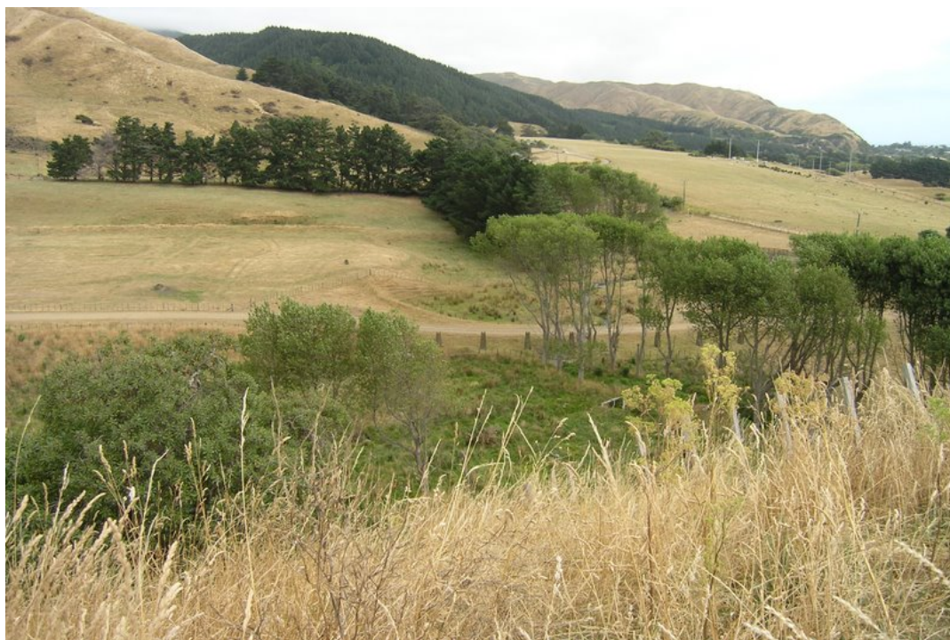
Looking south from proposed track

Further tracks are proposed including one to a Lookout within the farm and a connecting one up to Campbell Mill Rd.