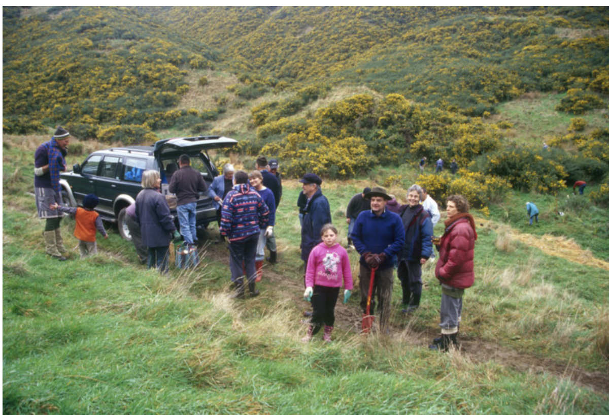
In Carex Valley

We planted alongside two branches of the Whareroa Stream and will continue this next time. It is pleasing to plant next to mature examples of the same species – giant carex secta and giant umbrella sedge.