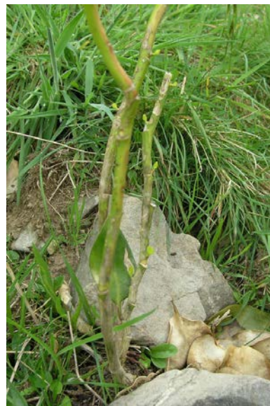
New buds after goat damage