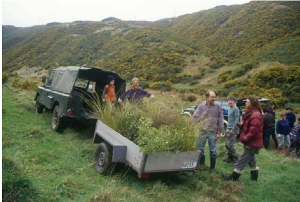
In Carex Valley