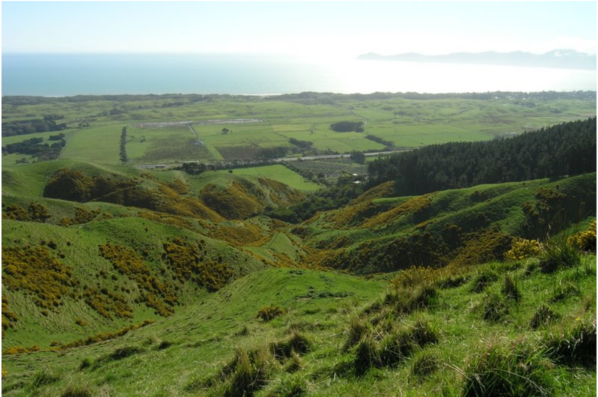
Looking down NW Valley, Emerald Glen Rd at bottom, out of sight beyond Big Bush. Very steep terrain, now retired.