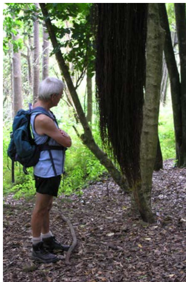
Griselina lucida aerial root in Matai Bush