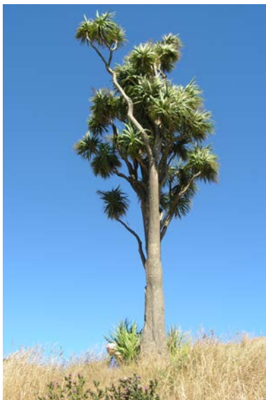
Ti Kouka with new growth from base