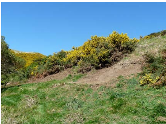
Gorse slopes cleared in the Dell