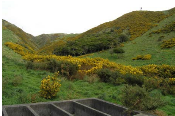
Corner of settlement chamber, SE Valley

Normally this would be rather late to plant but the ground is so moist, they should get established before the summer. Those already in are doing beautifully – see photos.