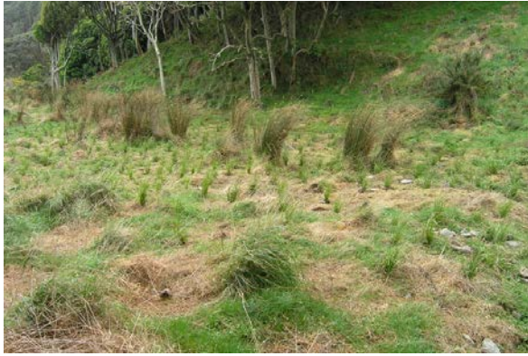
This year's plantings Carex virgata below Kamahi Bush

After planting we'd like to put carpet around the new plants whilst the ground is still moist – a good supply has appeared from various sources – thanks. If you are recarpeting, we'd be happy to receive your old carpet (wool only). Send us an email (reply to this) if you'd like it collected or bring along to a working bee.