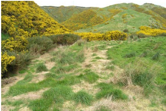
Planting site, SE Valley

We have been very fortunate to be given a further swag of plants from the QE Park nursery to plant in the areas already sprayed further up the SE Valley – see photos. The gorse along one bank of the stream is dying back and it would be really good to plant that strip so that natives have a chance to get established and suppress the gorse. The plants include wineberry, olearia, wharangi, five-finger, kanuka, putaputaweta and others, all locally sourced. Thankyou very much to QE Park staff.