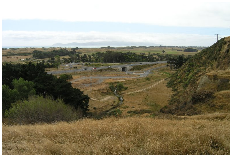
Looking west from proposed track