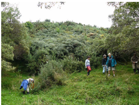
Dell gorse clearing: Before

Have a great day From The Whareroa Guardians