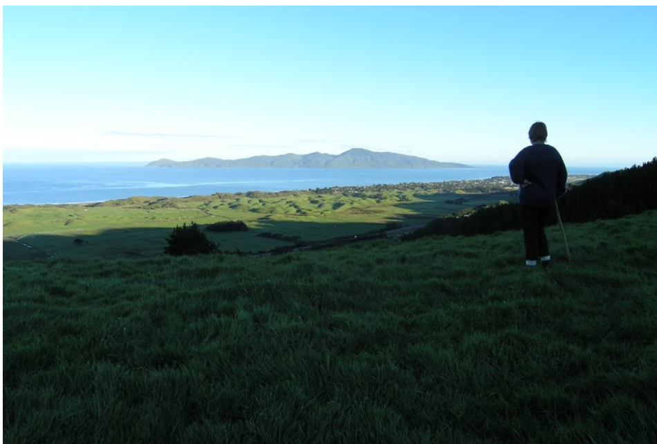
Early morning from Main Ridge, NE part of Whareroa