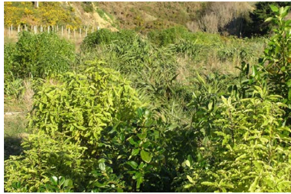
2 year old plantings near entrance