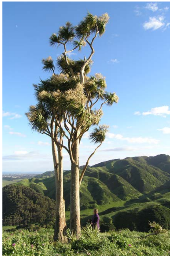
Ti Kouka in flower