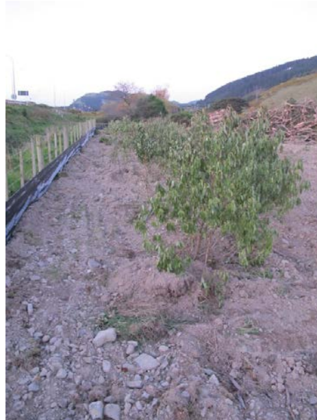
Transplanted trees from entrance, drooping

Work at the entrance has commenced, a bailey bridge for access for the contractor's vehicles is up, the actual road bridge will be to the west of this. The ground has been cleared and traps to prevent silt run off into the stream put up. The contractors have replanted nearly 100 trees and about 25 toetoe. The technique seems to have been scoop up a plant with soil, trundle it to a different place and plonk it on the ground. The angles of the trees are variable and as they were in the flush of spring growth they are looking very droopy. They have now been trimmed to reduce transpiration and give them more of a chance to recover. A wet spring will help.