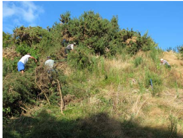
Gorse cutting in Dell