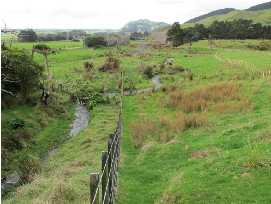
Lower Ramaroa planting site, looking north towards entrance, Mataihuka in distance

NZTA. Emerald Glen Rd Extension. Work on this starts within days, firstly building a bridge over the stream by the roundabout. The flat area between the two sets of gates will become the project site and access to Whareroa Farm will be restricted. Our monthly working bees can continue.