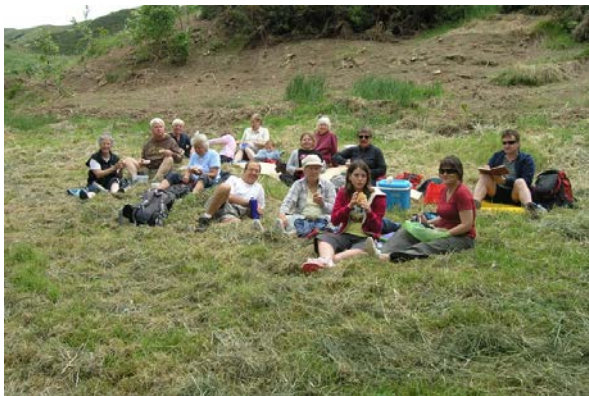
Picnic. NB the gorse clearing

The December picnic was enjoyed despite the cool overcast conditions. It was nice to be able to just relax and chat.