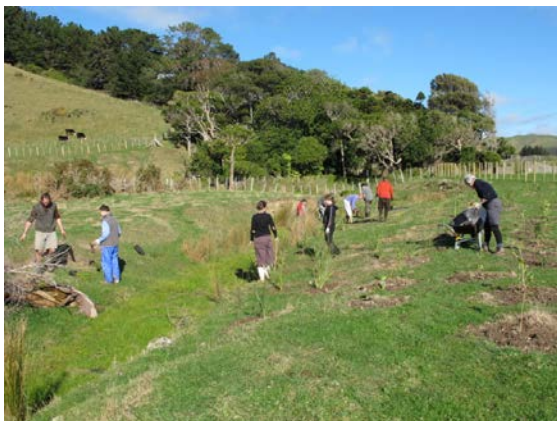
Ramaroa Bush visible behind