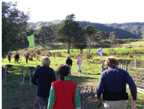
Back to work after morning tea