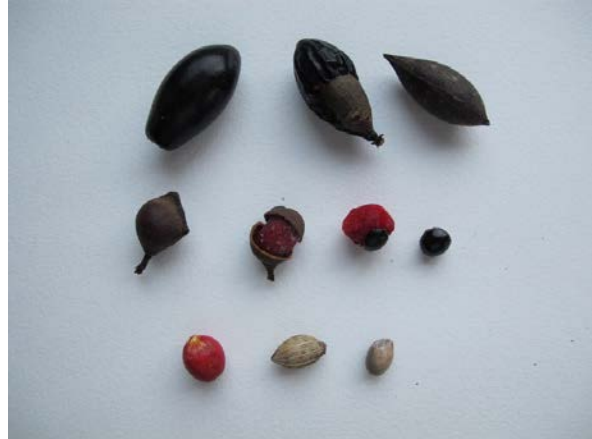
Seeds: top – tawa, middle – titoki, bottom - nikau

Preparations are going well for this year's planting project in the Lower Ramaraoa. The fencing lines have been decided and the fencer has started. The area includes some small wetland areas as well as the stream flats and some slope. A line for a future track and areas for picnics will be kept clear. NgaUruora will do the pre-plant spot spraying, funded by our Ministry for the Environment grant. Planting will commence in late May - dates to follow.