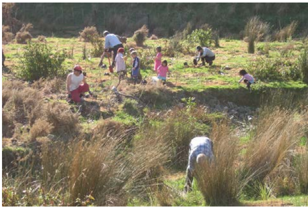
Whareroa Stream planting 2007

A couple of photos from previous years attached as a reminder - might be sunny or dismal! The plants don't mind.