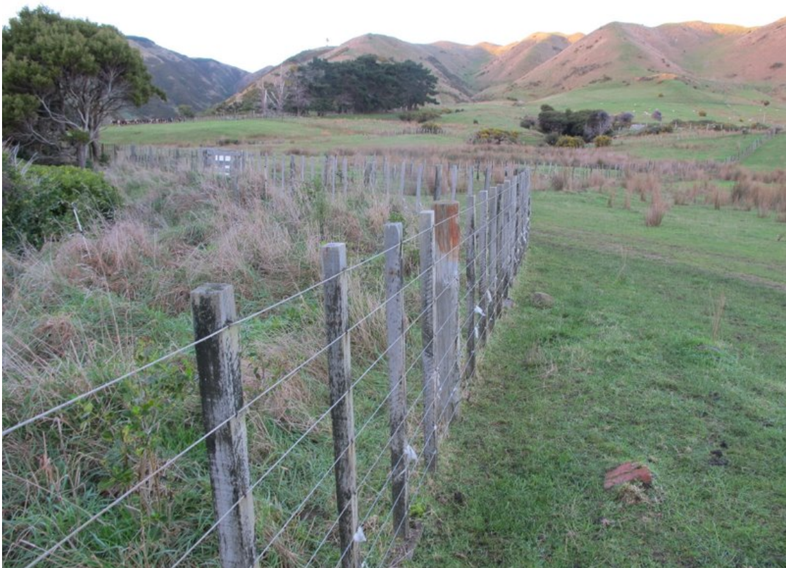
The Ti Kouka Valley in in the centre back to right of the pines, the ti kouka are on skyline just visible to centre left