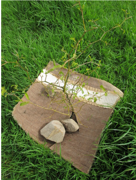
Kowhai from Mataihuka Escarpment

The priority now is keeping the young trees clear of long grass until they are established. The trees most at risk are those planted directly into the pasture without pre-sprayed holes and without carpet. Perhaps half have been carpeted with woollen squares (we don't use nylon as it doesn't breakdown). We will try and mark those in the grass so that they can be found easily later in the spring (if anyone has spare bamboo stakes this would be appreciated - please send a reply to this email).