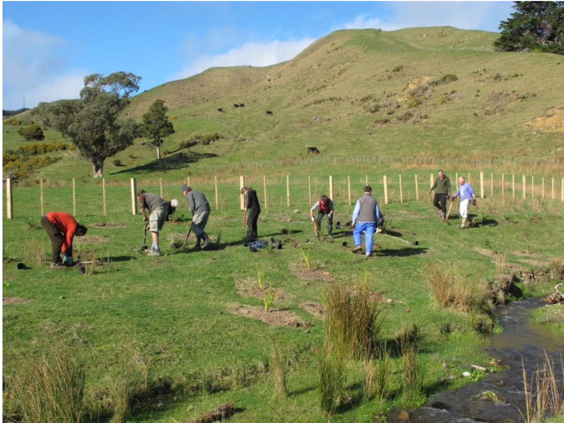
Planting between Ramaroa Stream and boundary with stock

KCDC have just donated 370 plants to Whareroa. These were grown by Titoki Nursery for the Western Link Road and are of a good size. QE Park nursery have also donated 35 good kahikatea, grown from trees in the park. Thanks to both nurseries.