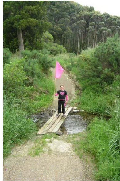
Ruby on temporary bridge