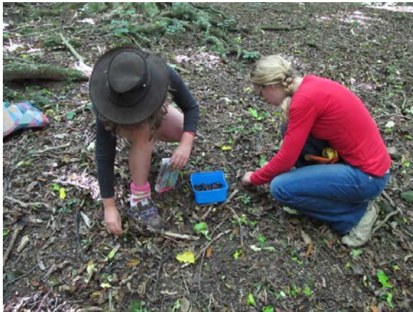
Gathering seeds in Kohekohe Bush