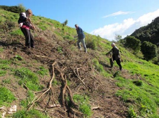
Clearing in Dell