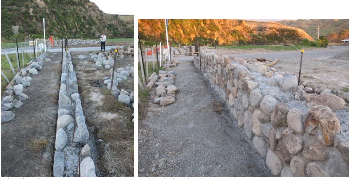
After 1st weekend