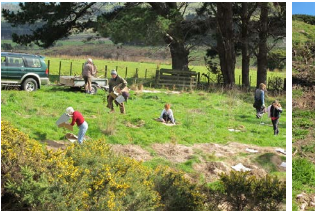
Distributing carpet squares Ti Kouka