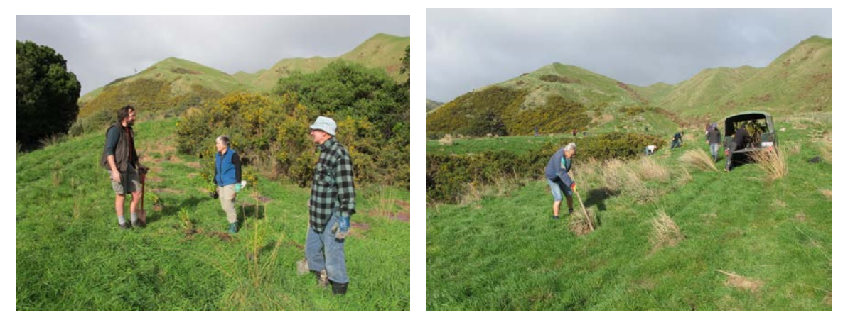
If Ti Kouka planting is finished on Sunday, the first weekend in August will be a working bee back at last year's Ramaroa Stream site to release those plants.