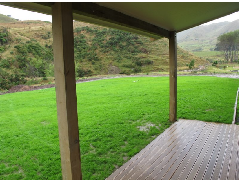
New deck and grass area at entrance

(Dependant on completion of the infrastructure works). A group are working on preparations for the day, more information about the celebrations will emerge soon.