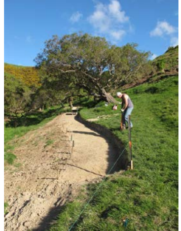
Bernard cutting track into Dell

The Dell - path improvement is proceeding with the top half complete and just sown with grass seed. It will be ready to use in a couple of months. In the meantime there is a "bypass" around the ngaio tree. Experimental plantings of tiny (thus cheap) carex into carpet have been done. So far only one has suffered pukeko pull-up.