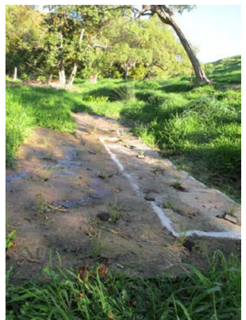
Carex secta planted into carpet in the Dell