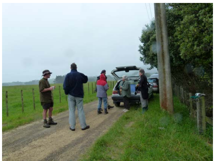
morning tea out of boot, still very welcome

This Sunday's "extra" working bee is to clear around trees planted 3 years ago in the upper Dell "Love Grove", funded by a collection at Al and Nicola's wedding. Some are a bit swamped by gorse so it's hand saw and lopper terrain, some are just in dense grass needing shears or grubbers. There's also some blackberry for the hardy. Leather gloves a must. It is a lovely area up there. Please bring your own morning tea as a bit remote.