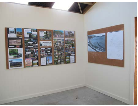
Whareroa Guardians' display set up by Ann Evans