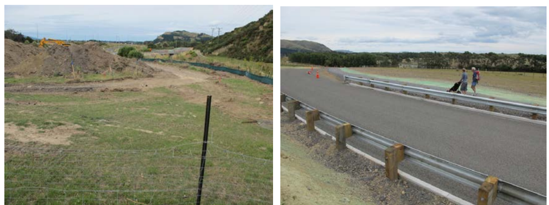
Waterfall Rd earthworks

The contractors are now working on the entrance to the farm itself: roading, carparks and earthworks. The picnic area has been cleared, topsoil applied and grass seeded. Flaxes which were uplifted from the original entrance area have been replanted.