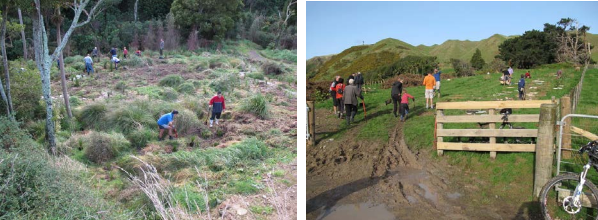
More planting Lower Ti Kouka