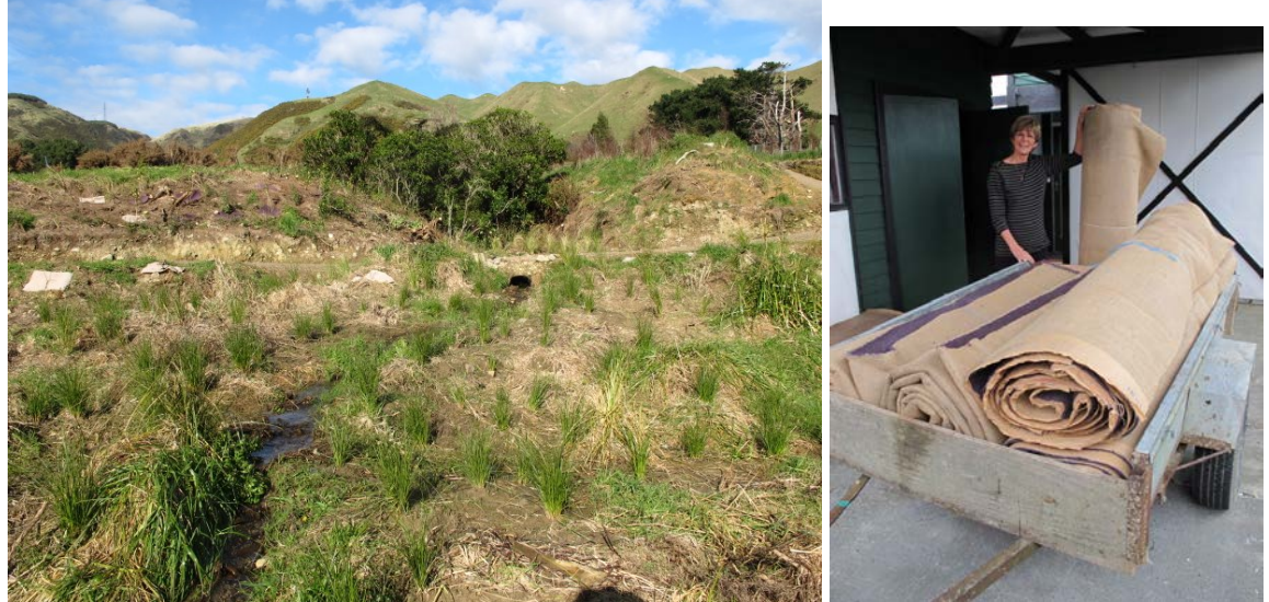
Lower Ti Kouka

More weed clearing has been done along the Ti Kouka Steam – gorse, inkweed and a few elder trees. Some of the gorse will be left as a nursery, we notice that when it is cleared there are lots of seedlings present – mahoe, nikau, kaikomako, titoki, kohekohe and kohuhu. Mamaku tree fern is also popping up. The new plantings will enclose that gorse and form a wind break around the NW corner of the Matai Bush.