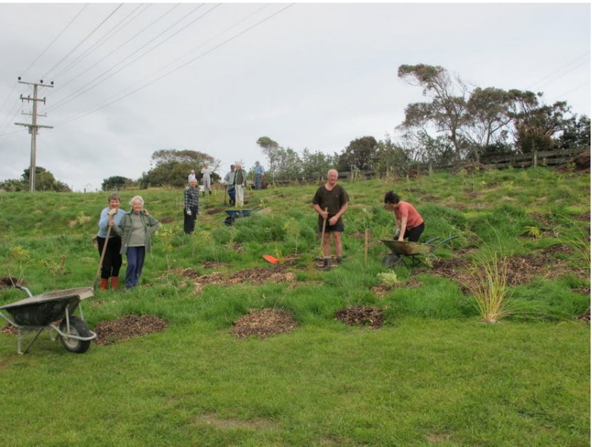
The mulching group

Next Working Bee, 6 November, it'll be the turn of the Ramaroa plantings for releasing.