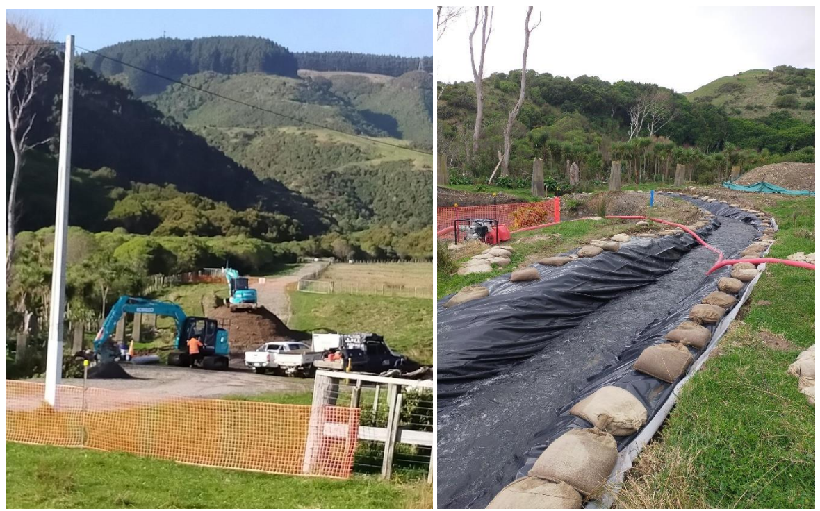
Whew, a big job!

Work has started. That section of the race will be closed for a couple of weeks. Walkers will use the Coastal Lookout/Forest Loop tracks; bikers and horses (and walkers if they wish) will follow a temporary bypass route across hilly paddocks, accessed off the road to the farmhouse and joinng the track to the Cairn. It will be well marked. Take care as it is not a developed track and the ground is pretty wet.