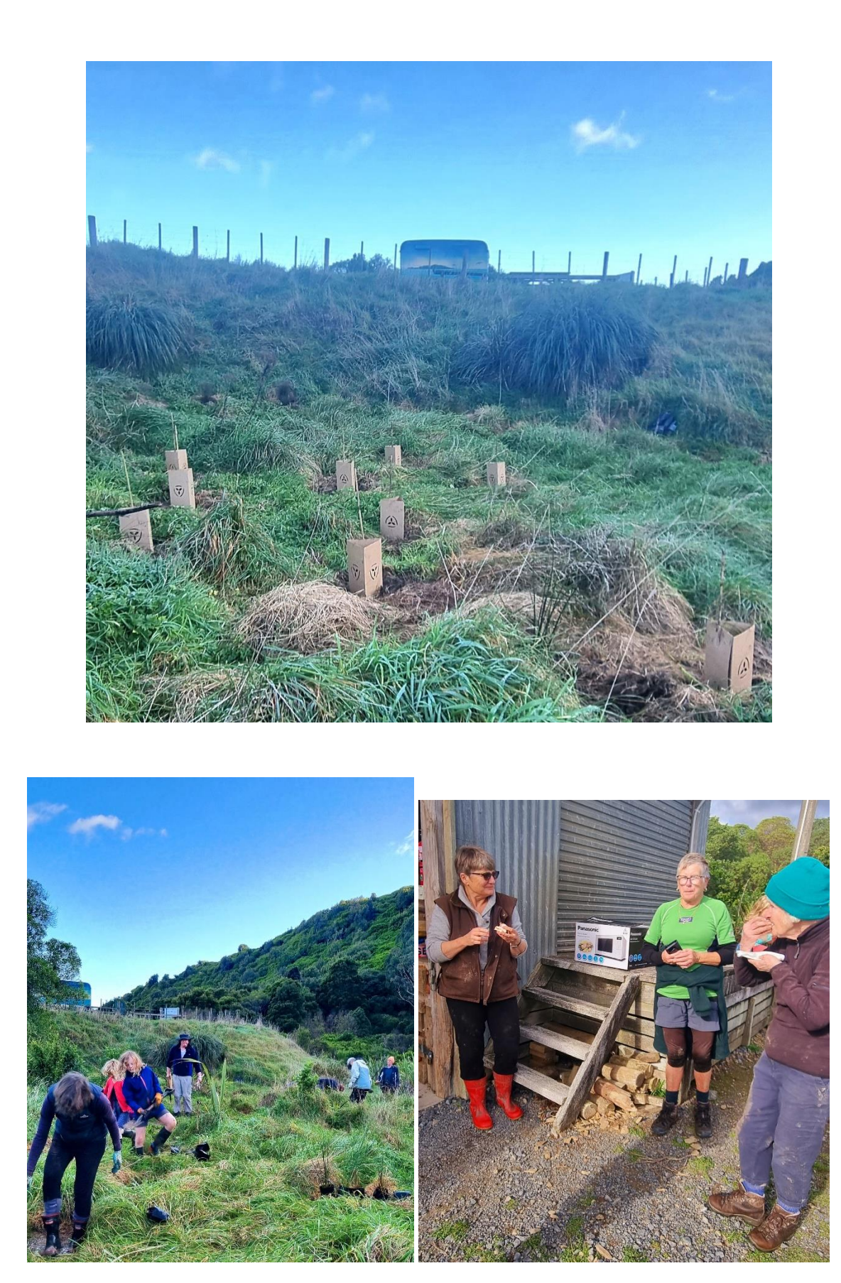
Many thanks to the planters – names in the next Update.