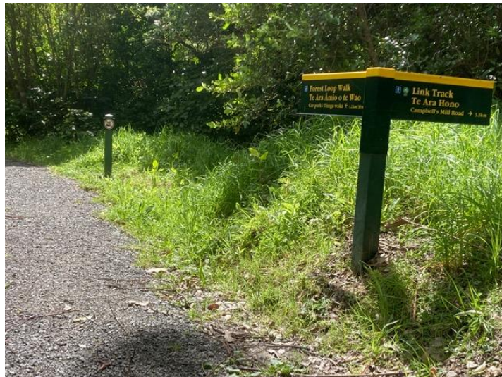
“No Bikes” sign installed at far end of Forest Loop Track