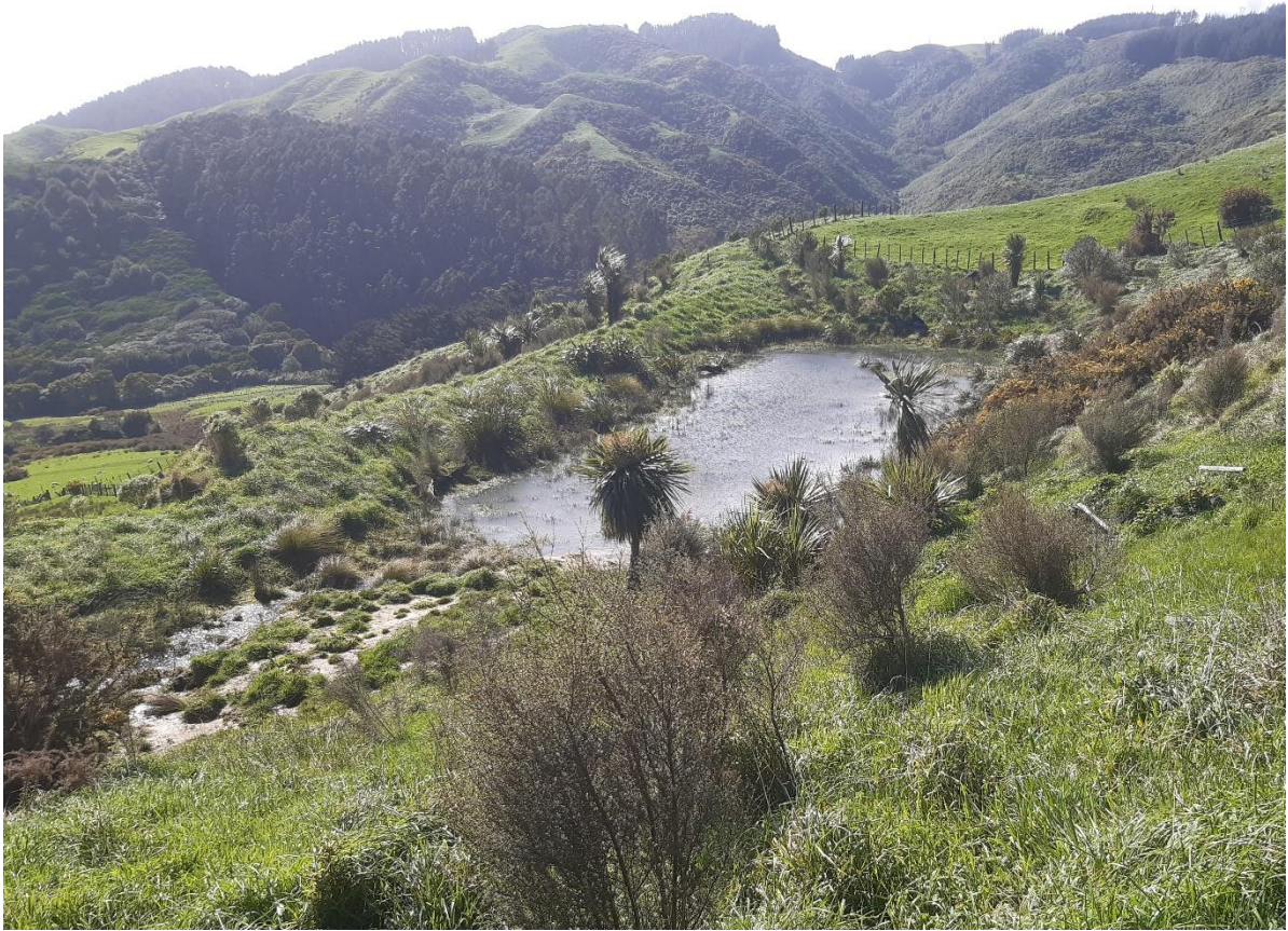
The ephemeral pond above the Cairn, natives are getting established around it.