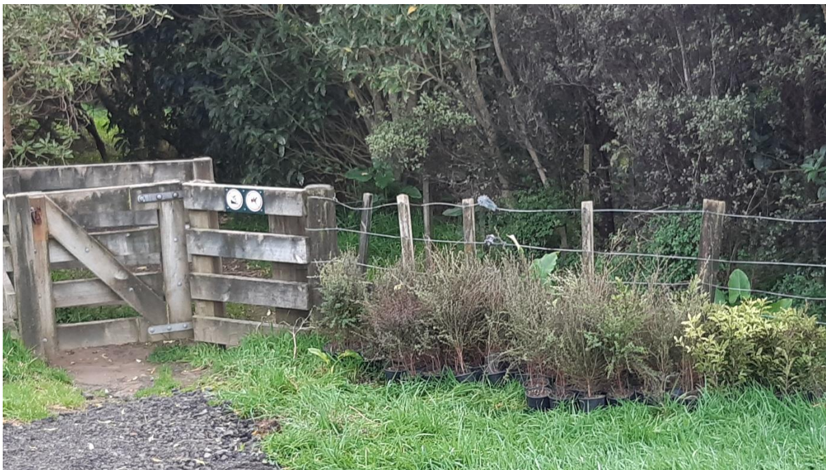
For main valley planting

600 lovely native trees are awaiting planting. There are several sites: at a retired section of picnic ground near entrance, along main Whareroa Stream valley, along lower Ramaroa and some ti kouka to go in the wetland. Trees are parked as close as possible and will need to be carried. Shopping bags would be useful though the manuka/kanuka can be carried in clumps of 4-5. Wear gumboots or boots as the ground is very wet. These trees came from Totara Glen Nursery at Palmerston and were funded by Trees That Count. Additional trees were grown by trustees Bruce and Ann. The wetland ti kouka must have guards or pukeko will have them out in no time. Further manuka and kanuka will be in trailer by the new culvert. PLEASE BRING YOUR OWN MORNING TEA. THANKS