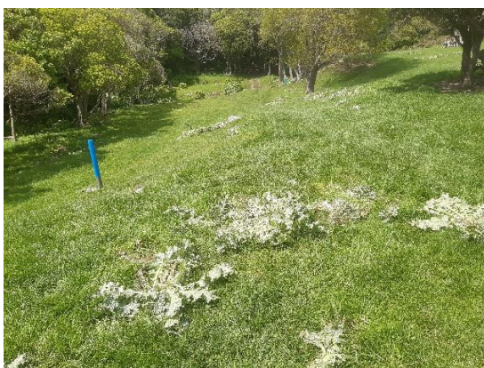
Dead thistles, Lower Ramaroa