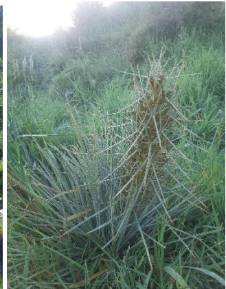
First flowering Spaniard at Cairn