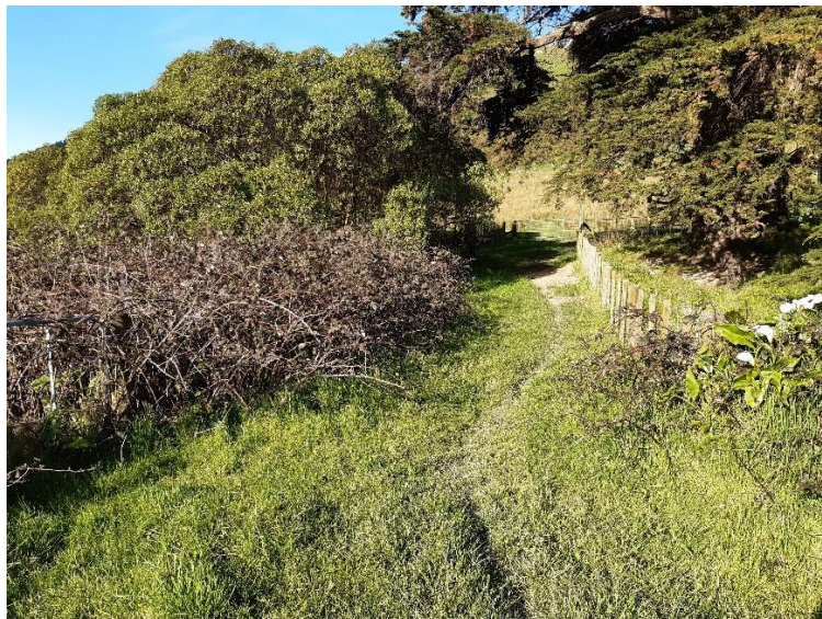
Blackberry encroaching onto farm tracks