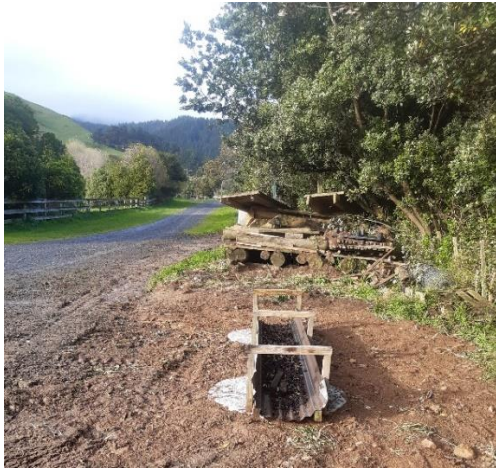
Bike-wash-to-be soakaway installed

Kapiti MTB Club has dug in a huge soakaway pit, all that messy concrete has disappeared! Then a proper bike wash will be built. Kapiti MTB Club have suggested a big tidy up in this area. We hope to arrange a joint working bee to do this.