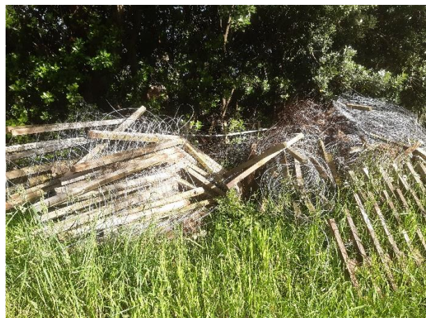
Part of the “pile” to be sorted