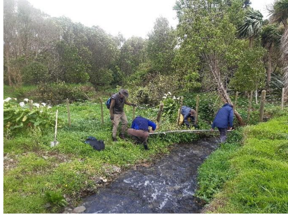
Ramaroa Stream: Extracting old “bridge” and clearing stream obstructions. These obstructions have pushed the stream over and increased erosion under our plantings.