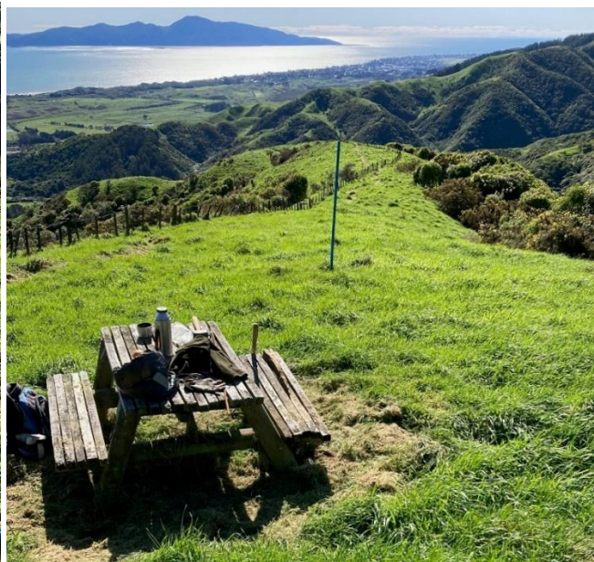
Table built by Don Beggs from recycled materials