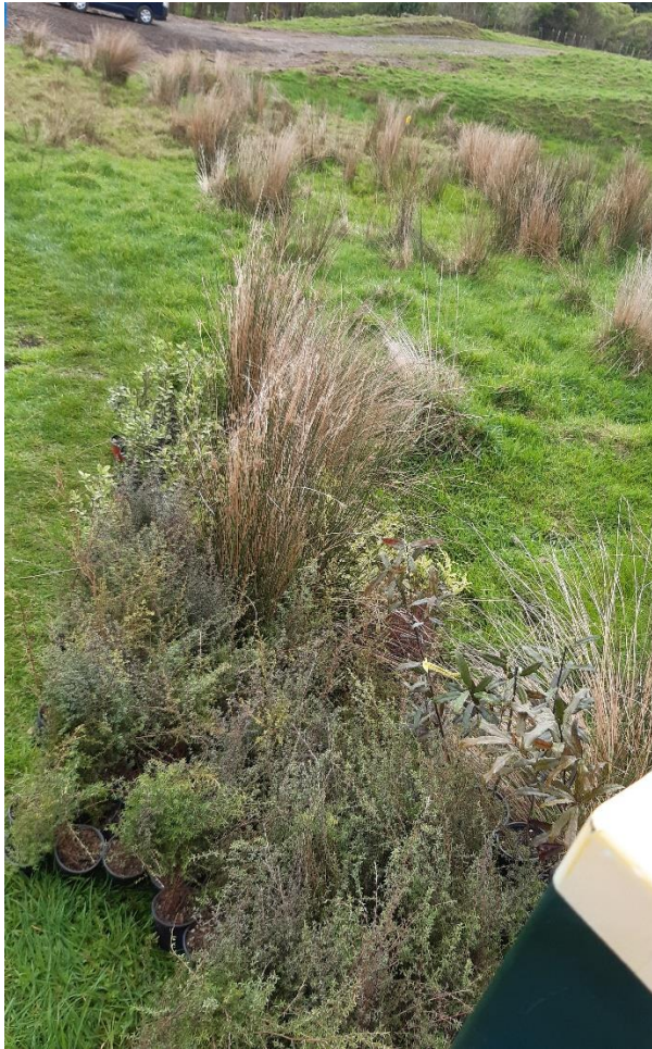
Ready for Ramaroa by the stile