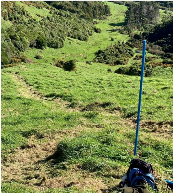
Looking down to beginning by the silt trap

Now is your chance to try this out. It is steep but exhilarating and has amazing views. When the top is reached. turn left and walk north along Campbell’s Mill Rd for 20 minutes to re-enter Whareroa and descend by East Ridge or Carex Valley Tracks for a great circuit.