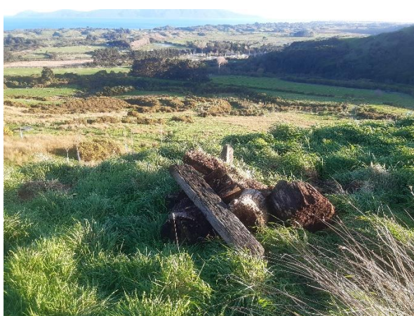
The area to be planted is at edge of the far bank, near this heap of logs (lizard habitat)