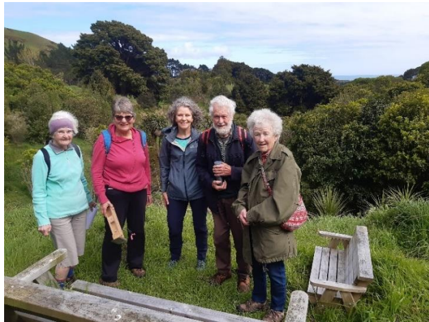
Te Wiki Kaumatua. "Whareroa Wanderers" at the Dell