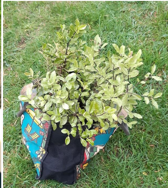
A suggestion for carrying plants easily