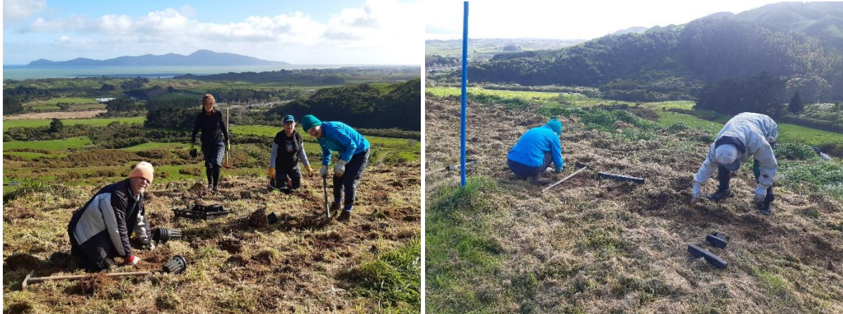
These bushes will need regular releasing – please take a grubber and keep weeds down