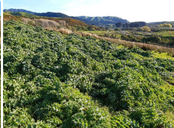
Variegated thistle on paddock

Weeds are an increasing worry – blackberry, arum lilies, water celery, pampas and tradescantia being our biggest concern as well as thistles on the paddocks. Volunteers spend a lot of time tackling these pests. Any help gratefully received - just slashing flowering heads off a few reduces their spread. We have been trialing eradication of arum lilies from the Dell as a start. If succesful we will try elsewhere