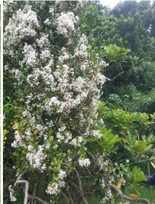
Native jasmine, Parsonia