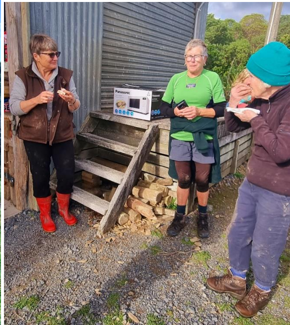
Many thanks to the planters – names in the next Update.