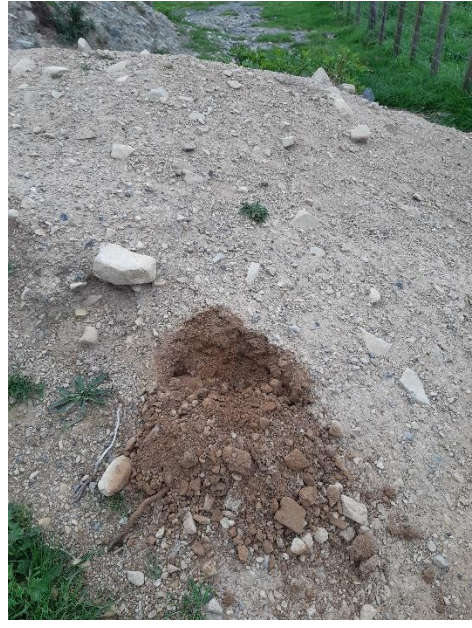
The dirt pile