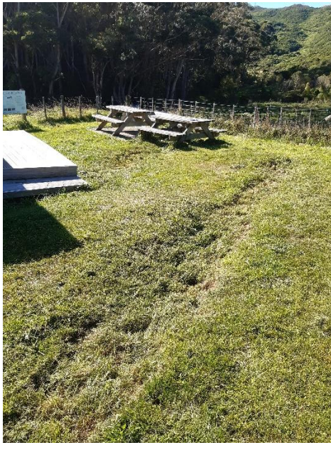
The "trenches" at the Hub

All Welcome, follow the flags. Please bring your own morning tea. Gloves, hand saws, secateurs and grubbers will be useful. Also (gum) boots as ground is very wet.