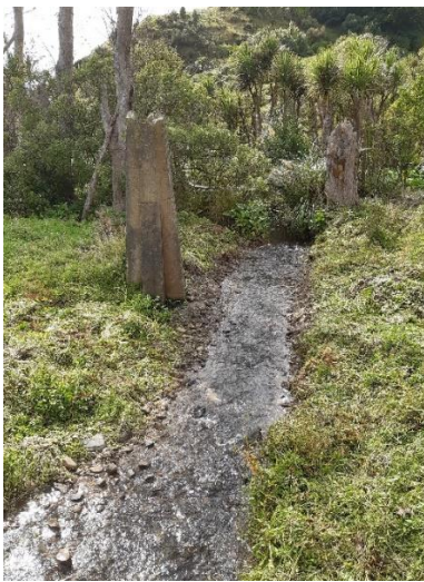
Downstream from the culvert