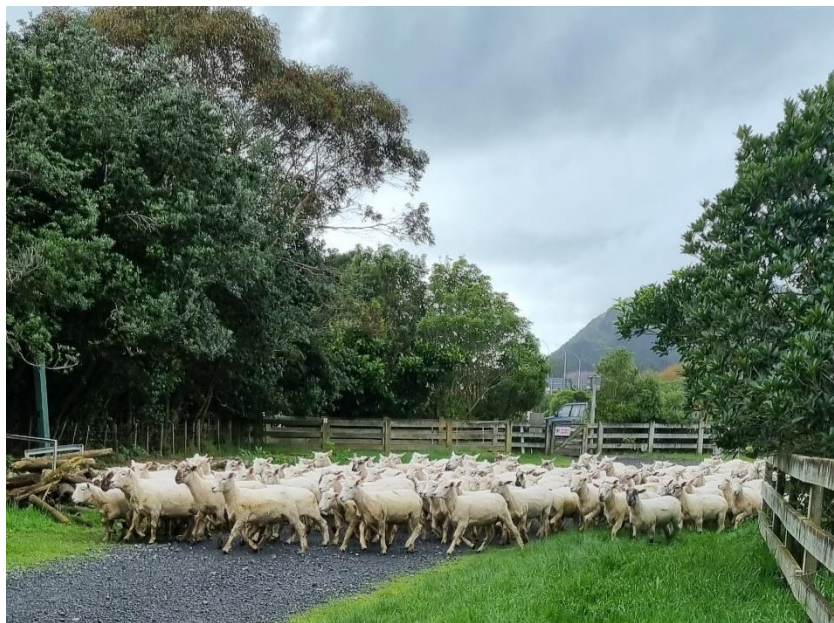
Sheep on the move