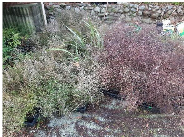
Plants already collected from nursery. More to come