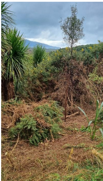
A lost totara found