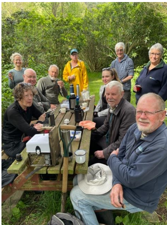
Catching up at Kahikatea picnic table