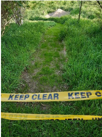
New grass Dell track