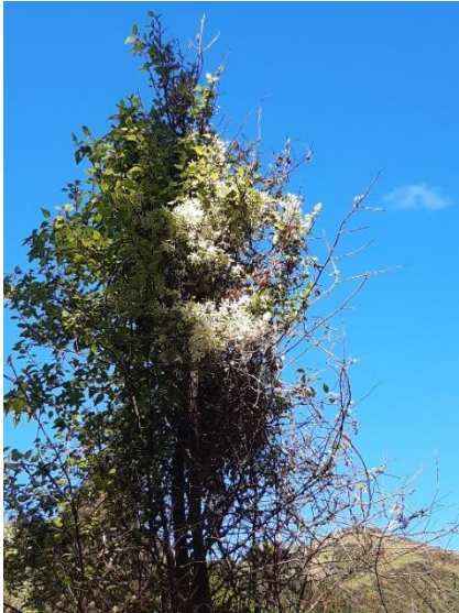
Clematis forsteri by Gums