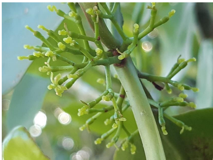
and early fruit. We have now found 3 mistletoe plants.