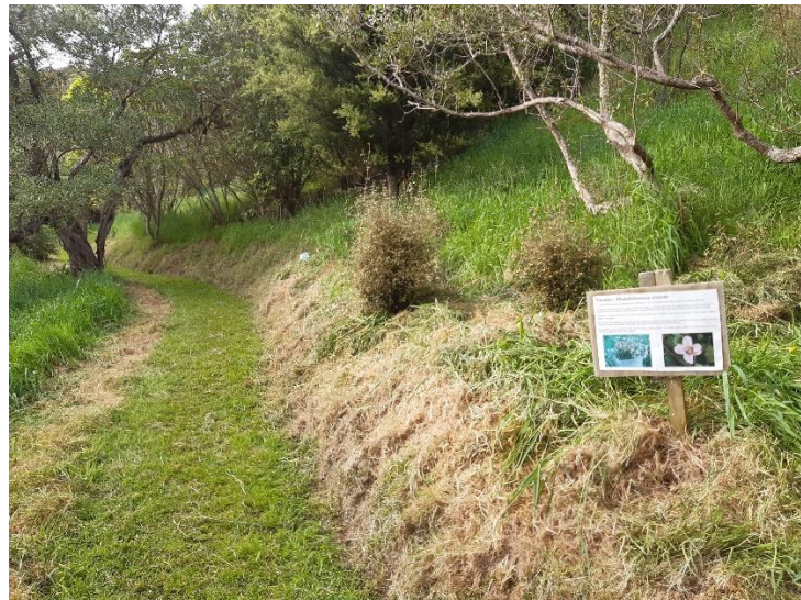
Dell track banks trimmed and raked – still some more to do