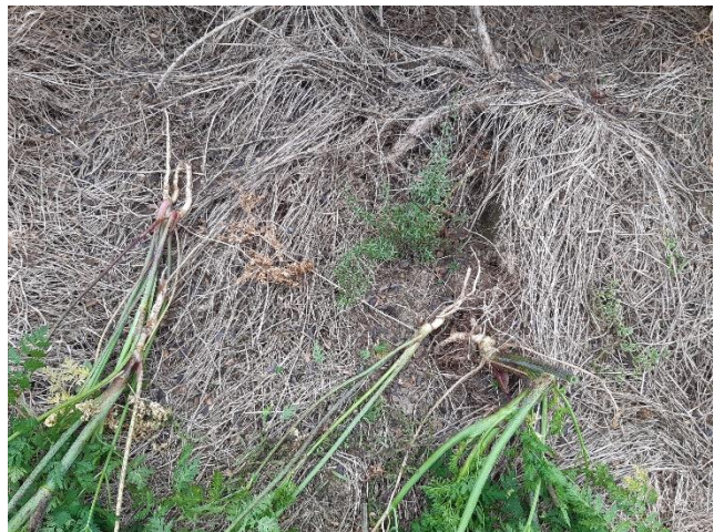
Hemlock, a prolific seed producer is a concern at the Ground Truth plantings on the Western Hills. Kanuka seedling visible after hemlock pulled up. Guardians have been doing some releasing in Upper Mamaku Valley.