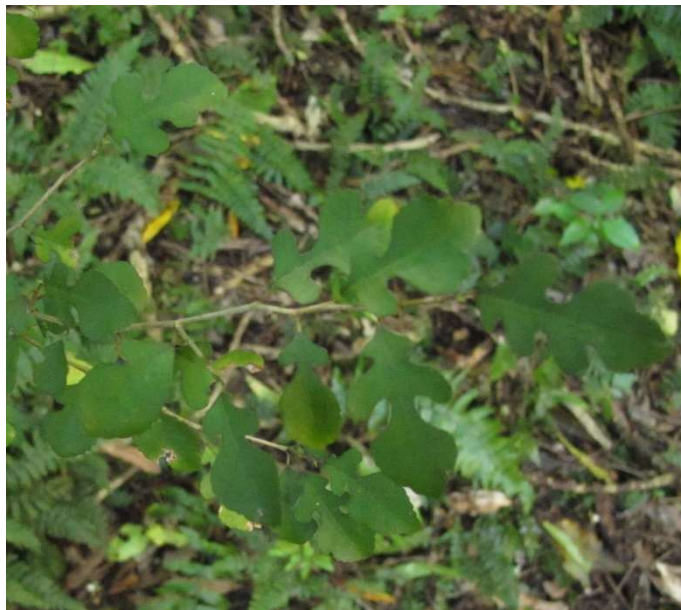
Milk tree seedling

See more here... https://www.nzpcn.org.nz/flora/species/prumnopitys-taxifolia/