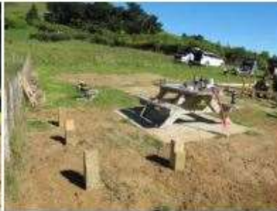
Piles ready for bench seat