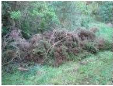
One of the cut gorse piles