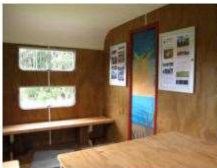
Interior showing information displays