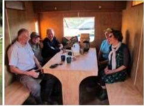
DOC's Suzi with trustees after a meeting at farm

The caravan was transported back thanks to the M2PP Alliance. It will be locked until inside work finished and mural painted. Once work is completed it will be open for all visitors to enjoy.