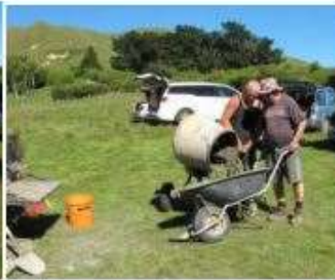
DOC's cement mixer