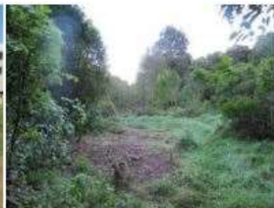
Area west of Gums cleared of gorse