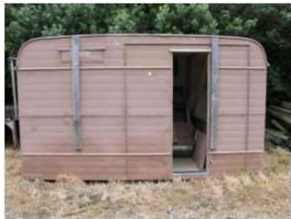
As it was