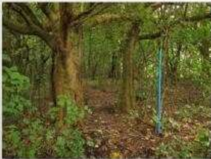
Kohekohe trees Ramaroa Bush