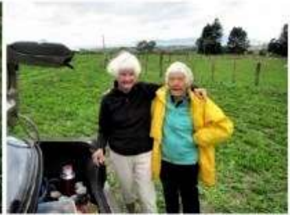
Supplying morning tea to volunteers