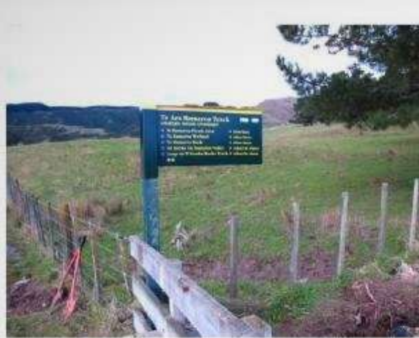
Sign at start of the track