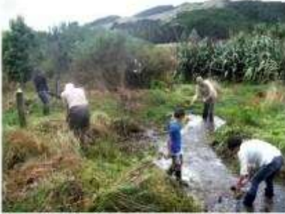
Clearing debris from stream