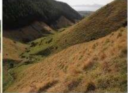
Looking down Ramaroa Valley to Kapiti