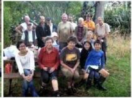
working bee April