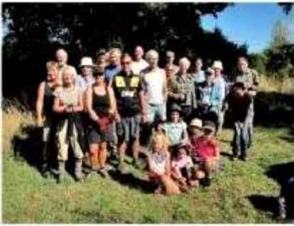
Working bee March