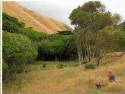
Just beyond Ramaroa Bush