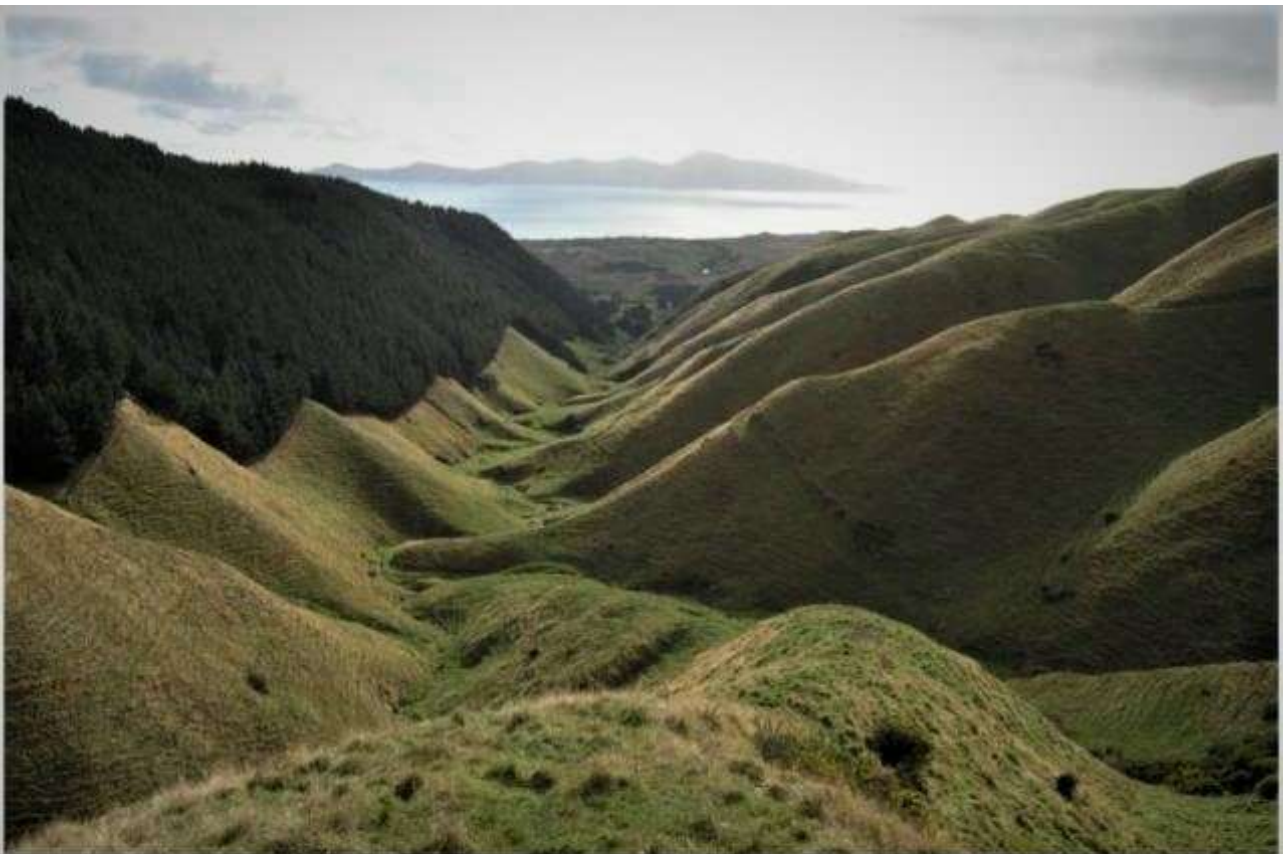
Looking west down Ramaroa Valley, track from Rocks centre right