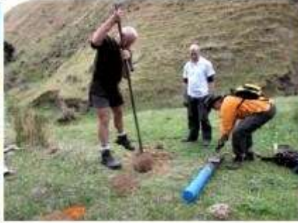
Putting up marker posts