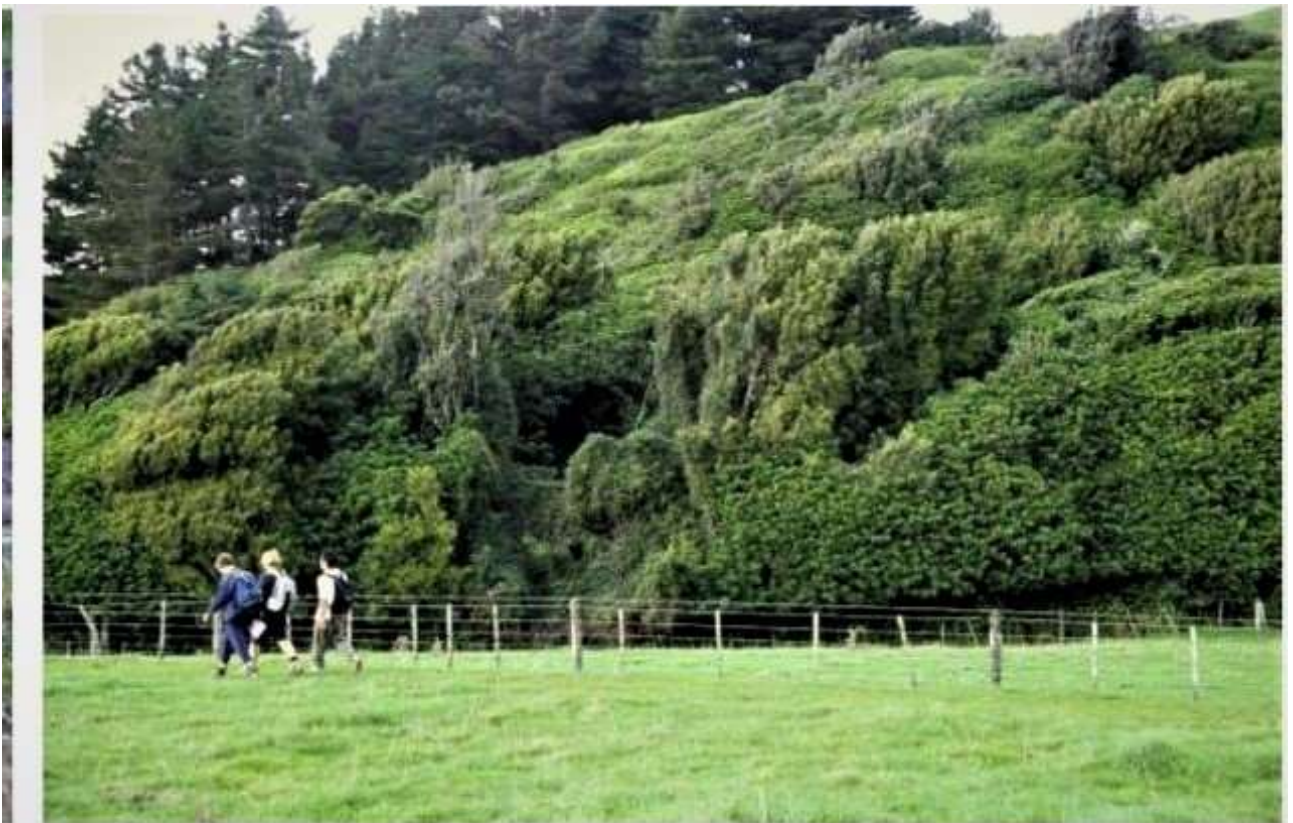
Ramaroa Bush – kohekohe. titoki. tawa and matai