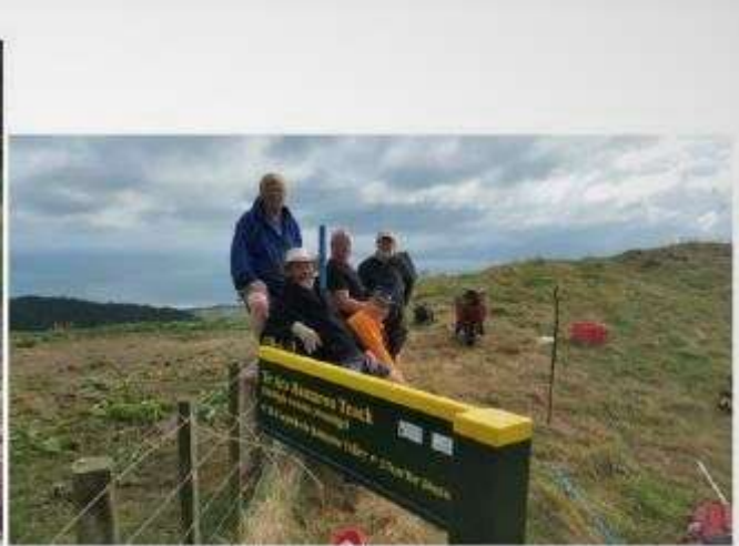
Sign at top of track, by Whareroa Rocks